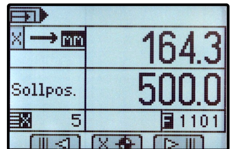
display structure 1-axis version